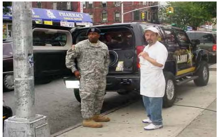
A SSG from the new US Army Career Center and a merchant survey the avenue during the center's grand opening celebration on Saturday, August, 2006.